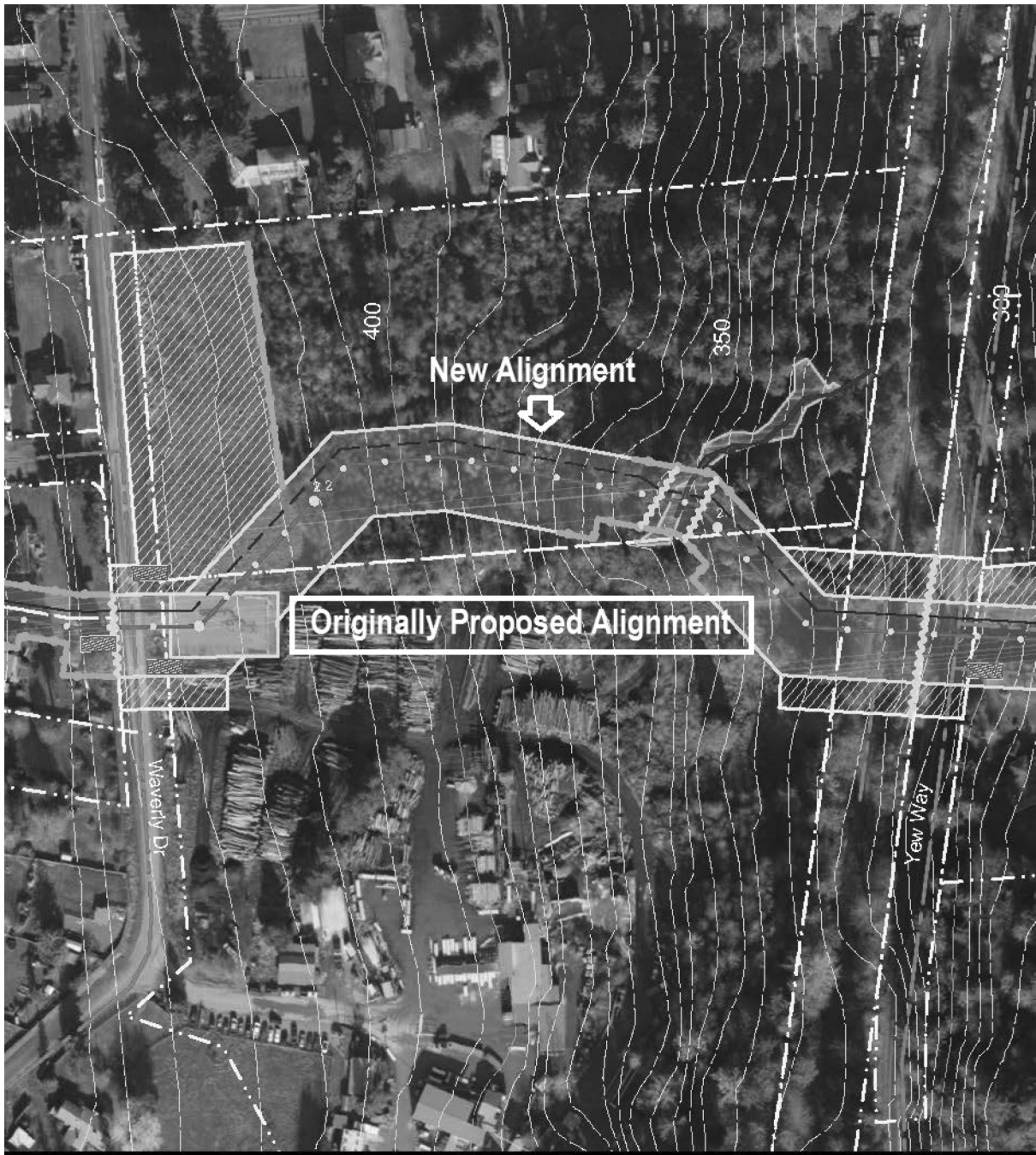
Proposed Realignment Around Fritch Mill