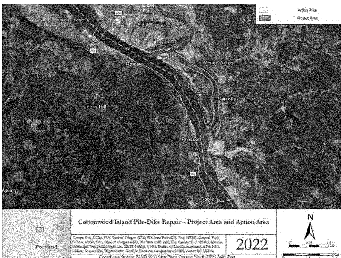
Figure 2—USACE Cottonwood Island Dike Repairs Project Site Map